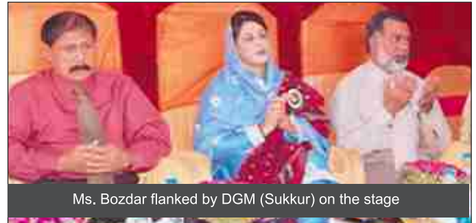
Ms. Bozdar flanked by DGM (Sukkur) on the stage

The Rs. 5.15 million project entails constructing 876 meters of 4" dia supply main with Taping Point at SM of Hussain Kalwar village. The project also involves 2" dia (696 meters) and 1" dia distribution main.