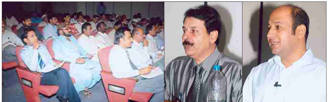
DGM (HSE) and MMCT Trainer addressing the audience