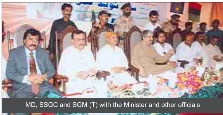
MD, SSGC and SGM (T) with the Minister and other officials

The project envisages construction of 105 km supply and distribution mains at a cost of Rs. 226.65 million. ■