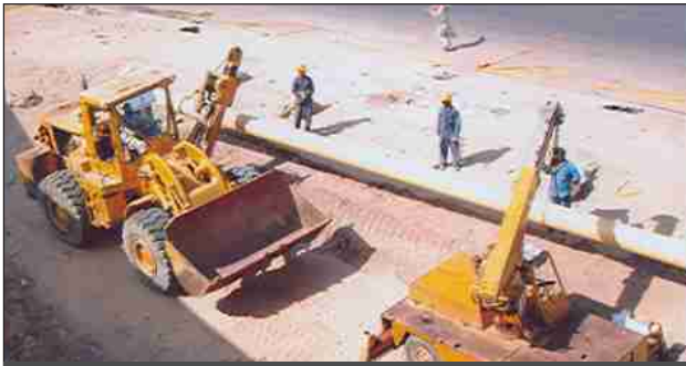
Pipeline segments being with help of through heavy equipment

In-house resources of Karachi Distribution and P & C Departments were utilized by applying best engineering management practices that resulted in completion of the job in a very timely and cost-effective manner. ■