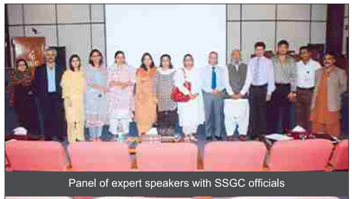
Panel of expert speakers with SSGC officials