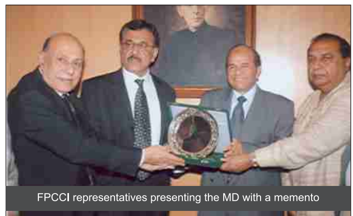
FPCCI representatives presenting the MD with a memento