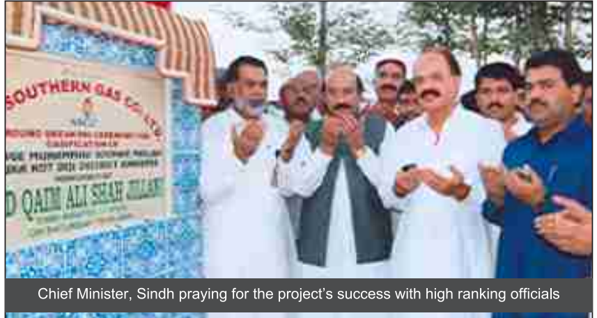
Chief Minister, Sindh praying for the project's success with high ranking officials