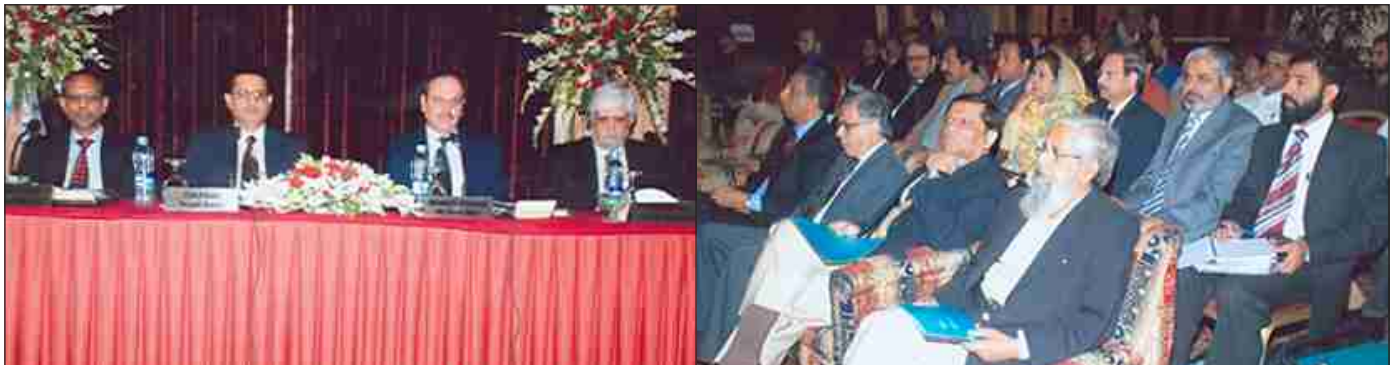
OGRA Chairman and members at the petition; a view of the Company management during the proceedings

S SGC submitted its revenue petition to the Oil and Gas Regulatory Authority (OGRA) on October 11, 2009 for increase in the Company's Estimated Revenue Requirement, due to the increase in cost of crude oil and HSFO in the international market and drift in the US$-Pak Rupee exchange parity.