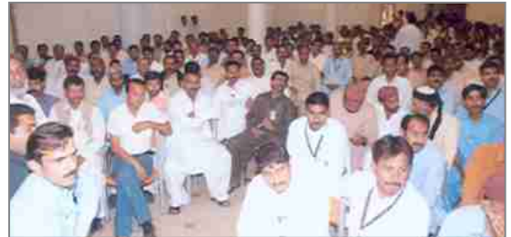
CBA office-bearers speaking on the occasion of a luncheon given by the Temporary Assignees in their honour at Karachi Terminal in November 2009