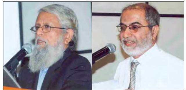
SGM (ES), GM (IA) presenting their welcome address and vote of thanks