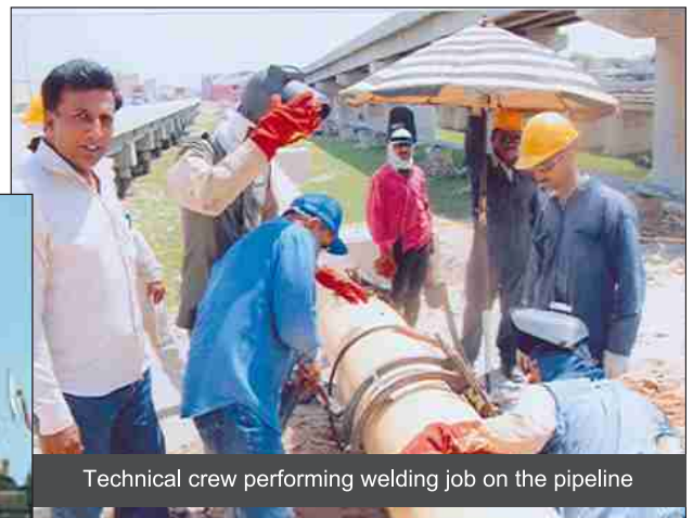
Technical crew performing welding job on the pipeline