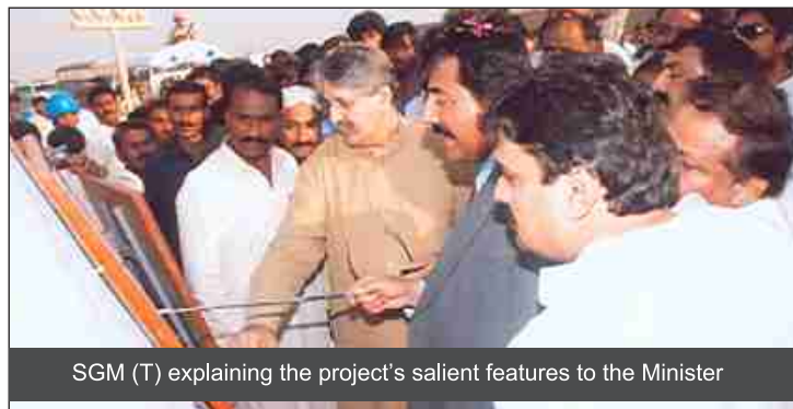
SGM (T) explaining the project's salient features to the Minister