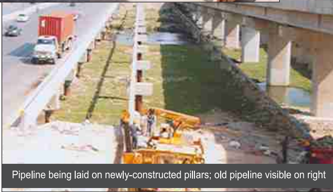
Pipeline being laid on newly-constructed pillars; old pipeline visible on right