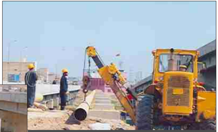
Pipeline being slid over the newly-constructed pillars